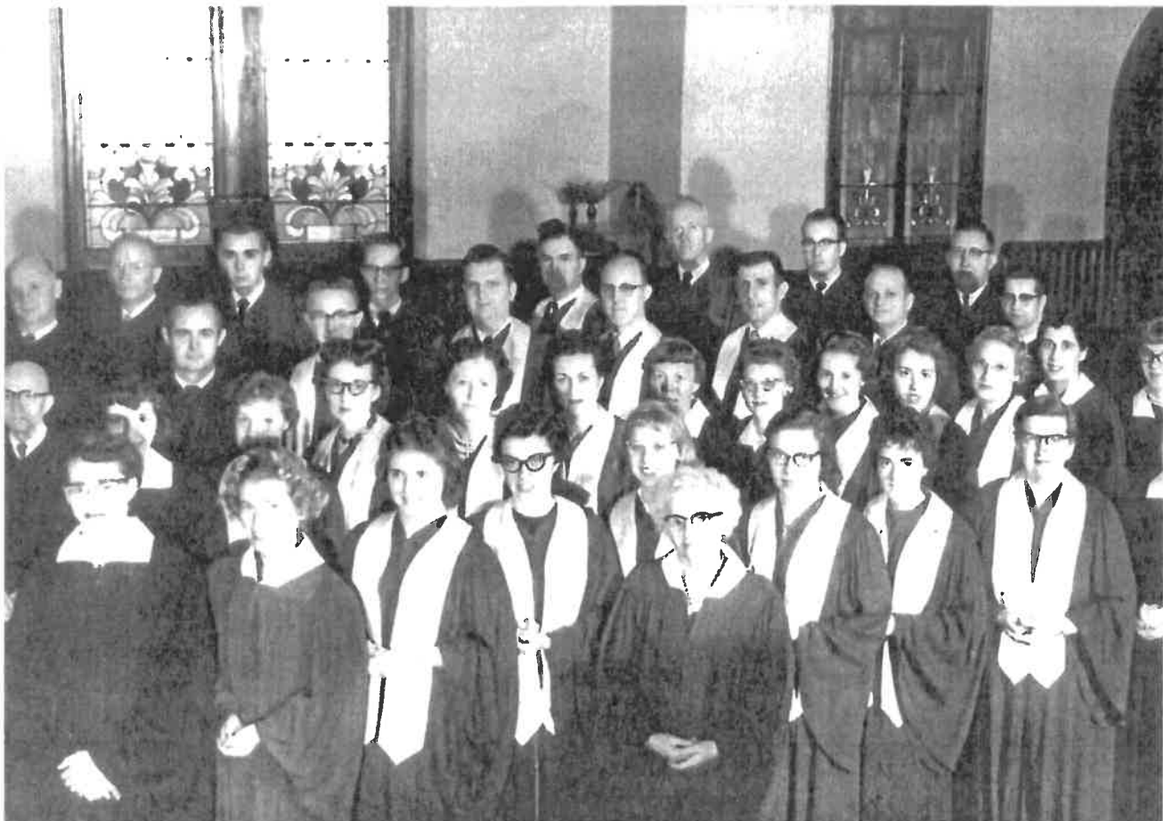
1950's Community Choir

"Do not conform to the pattern of this world, but be transformed by the renewing of your mind"