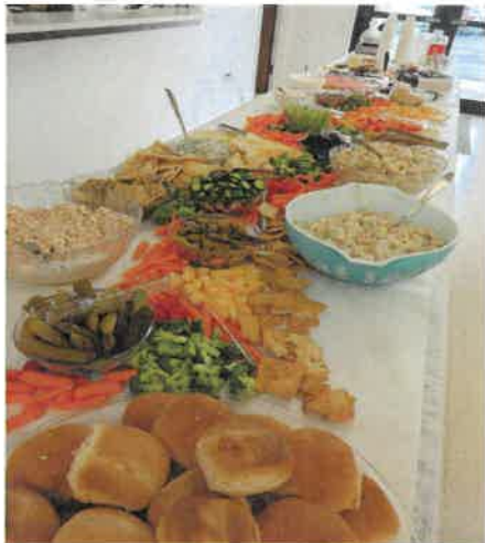
THANK YOU DISCIPLES WOMEN'S MINISTRY FOR THE WONDERFUL LUNCH ON MAY 7TH